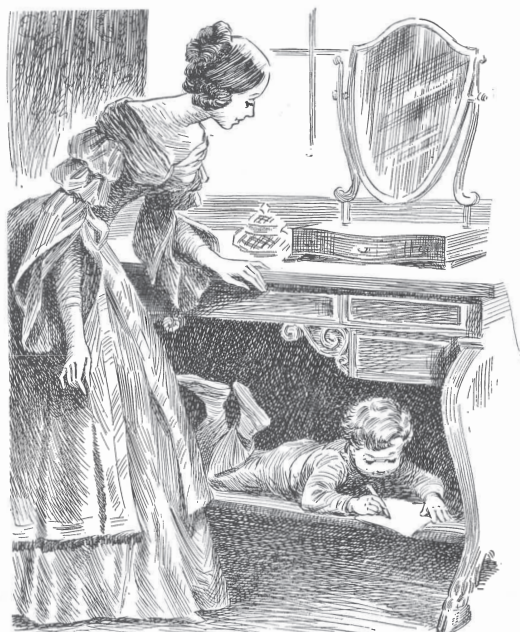
When they were very young: Juvenilia of some Celebrated Artists (Series Two)